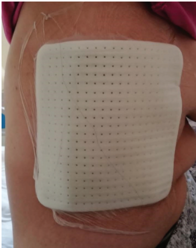
Figure 2: Chrisofix Chest Orthosis placement on the fracture region.

(Figure 2). The pain was significantly reduced compared to the first day [third-day visual analog score: 3, first-day visual analog score: 9 (In visual analog scale higher scores indicate worse pain)]. After three days of hospitalization, the patient was discharged in a healthy condition. An informed verbal consent form was obtained from the patient.